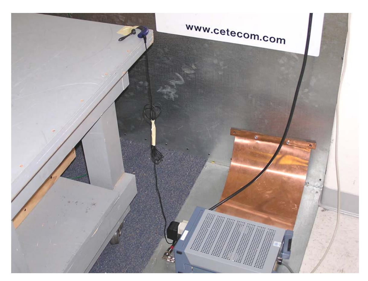
Test setup – AC Line Conducted Emissions