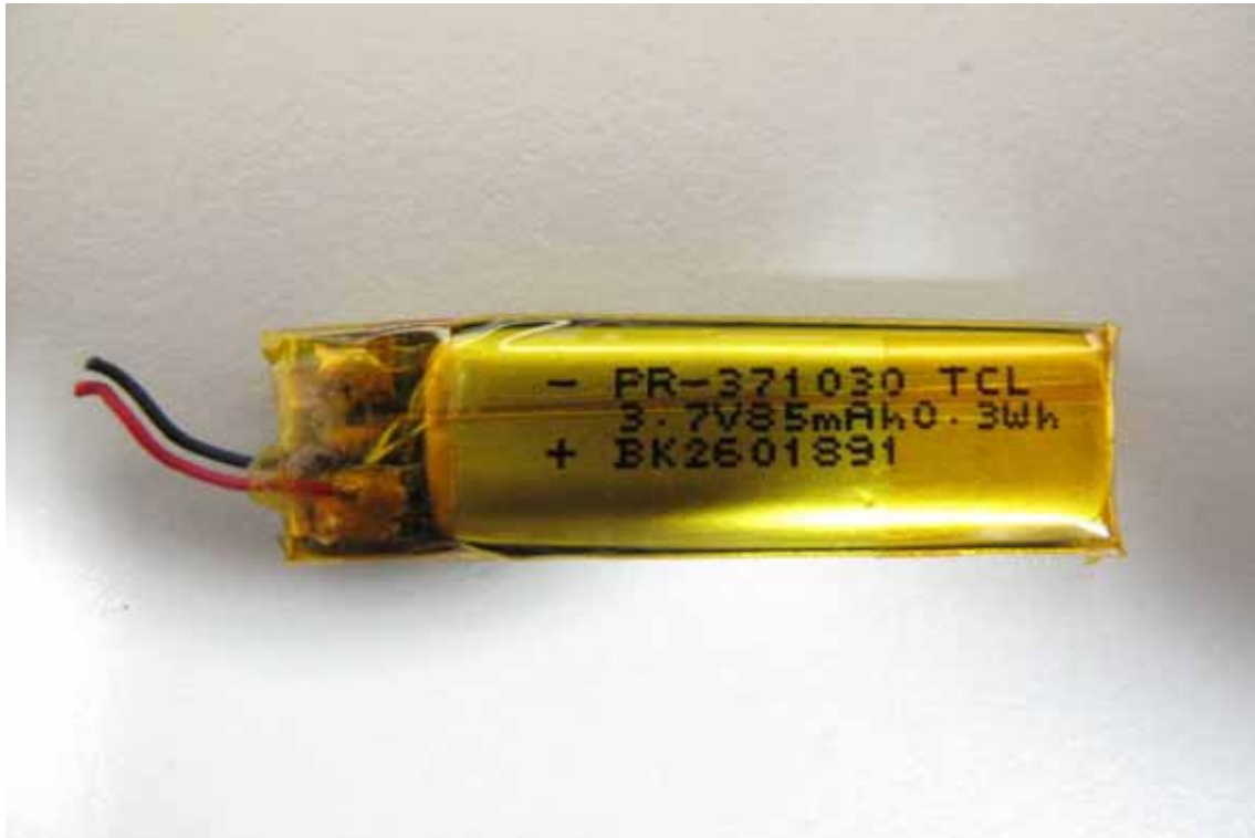
Open View of EUT - 1