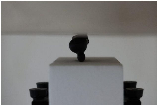
Front at 0 mm