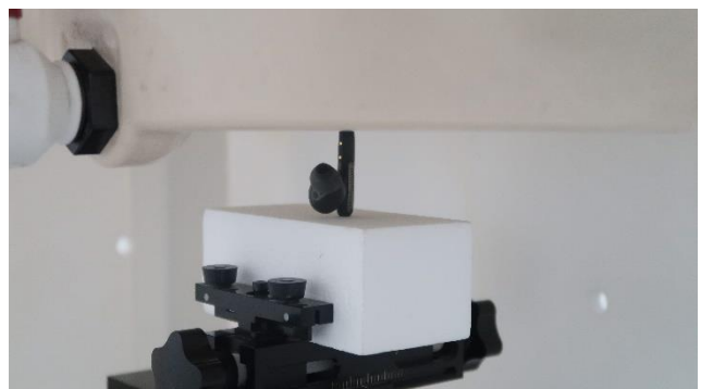
Bottom Side at 0 mm