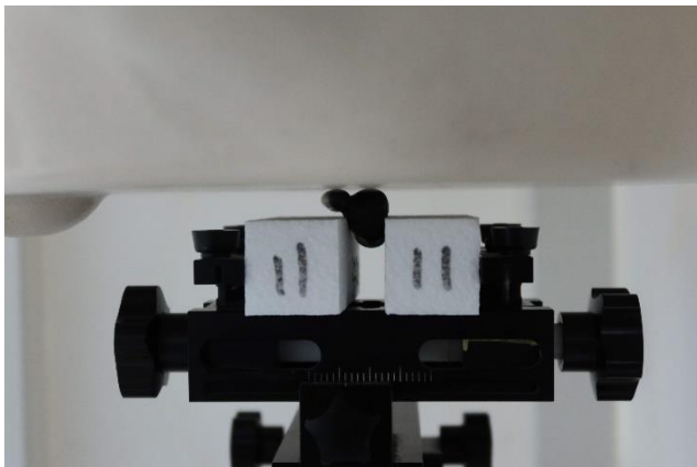
Left Side at 0 mm