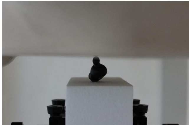
Back at 0 mm