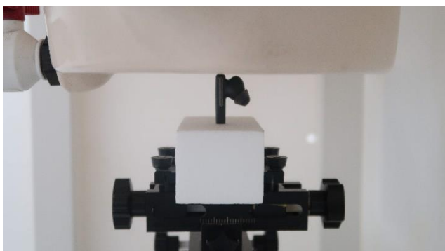
Top Side at 0 mm