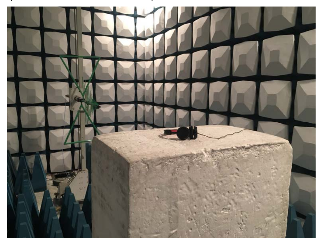
Description: Radiated Emission Test Setup for 1~18GHz

Description: Radiated Emission Test Setup for Below 1GHz