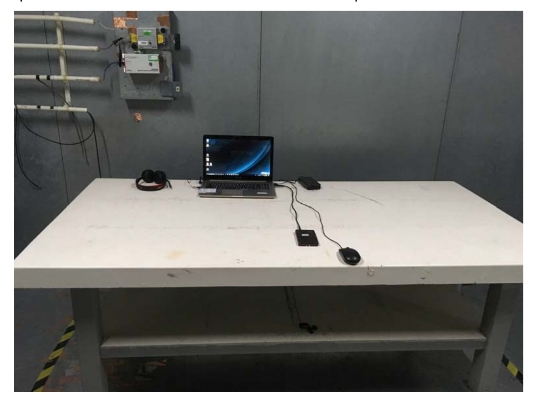
Description: Side View of Conducted emission Test Setup

Description: Front View of Conducted emission Test Setup