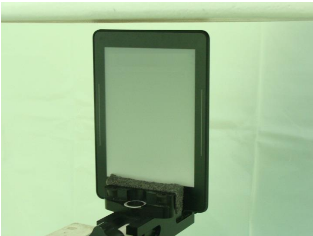
Edge1, Test Separation 0.5 cm