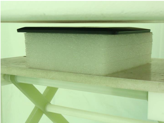
Bottom Face, Test Separation 0.5 cm