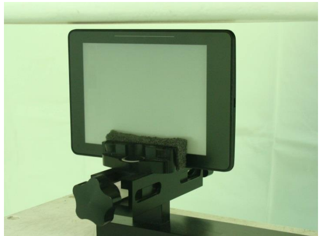
Edge2, Test Separation 0.5 cm