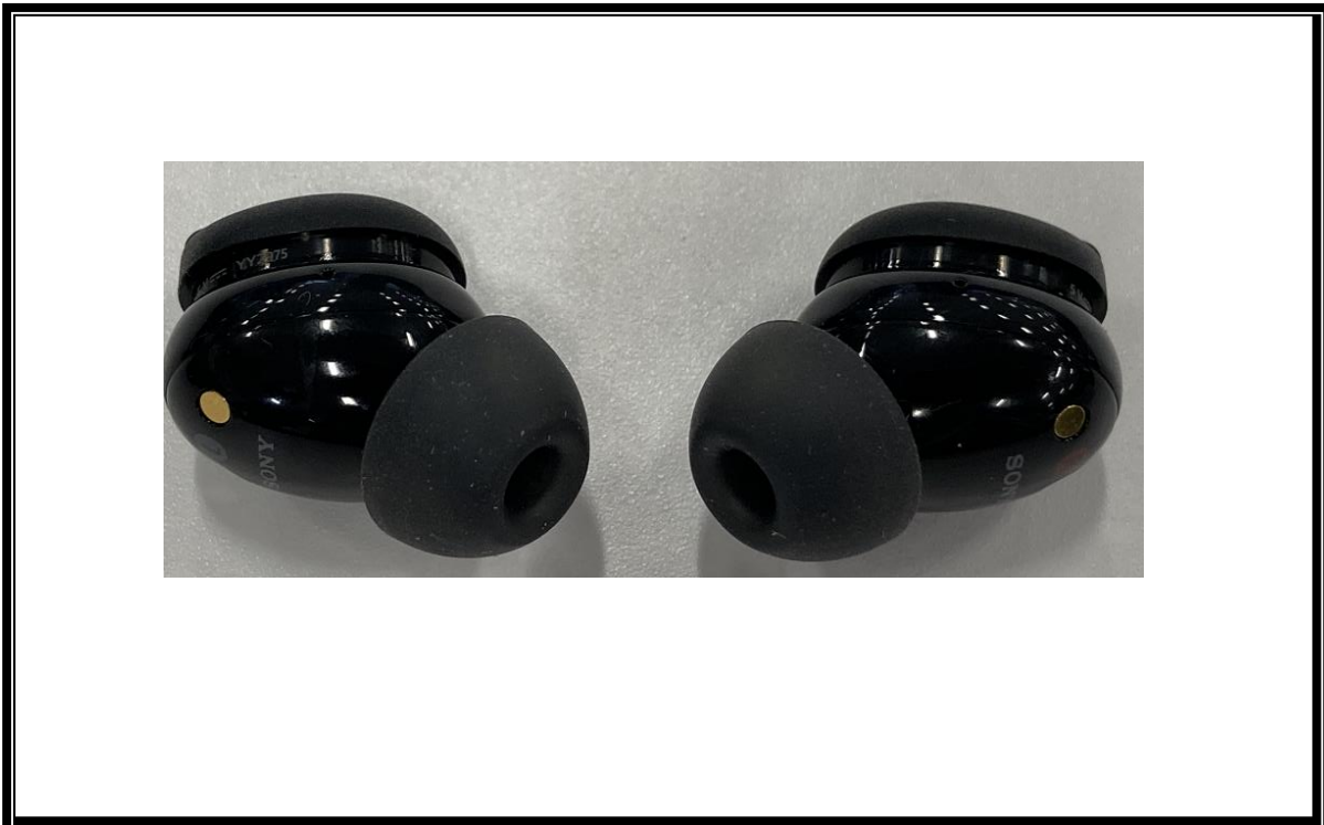
w/o fitting supporter