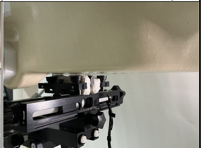
Vertical-Back of EUT with 0.5 cm Gap