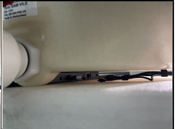
Horizontal-Down of EUT with 0.5 cm Gap