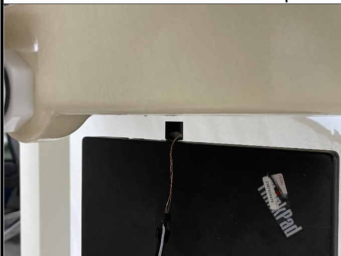
Tip Mode of EUT with 0.5 cm Gap