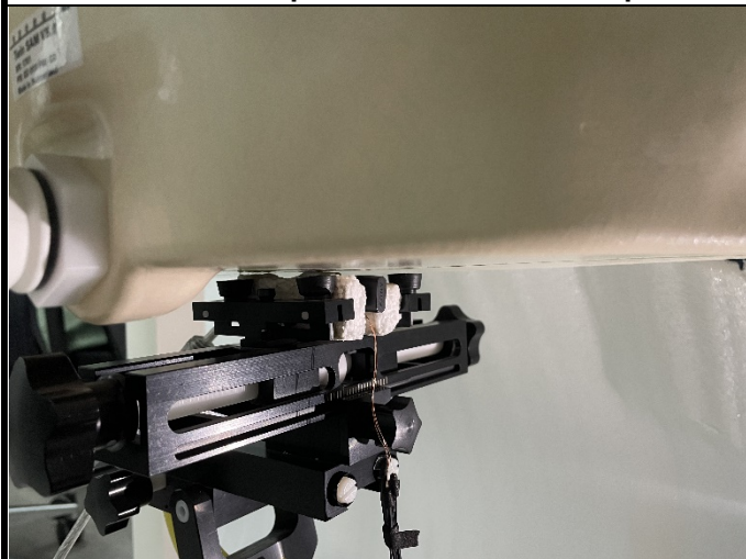
Vertical-Front of EUT with 0.5 cm Gap