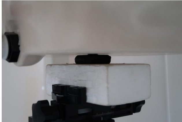
Back, Test Separation 0 mm