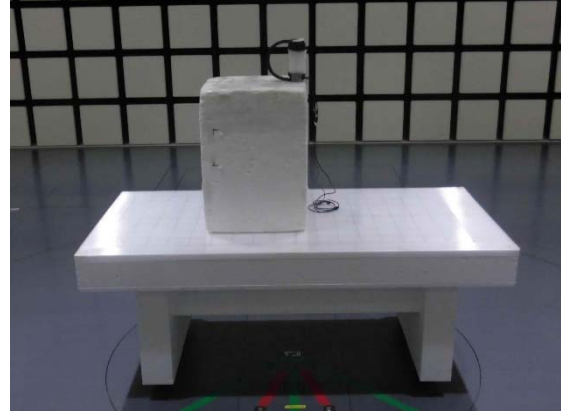
Front (above 1 GHz)