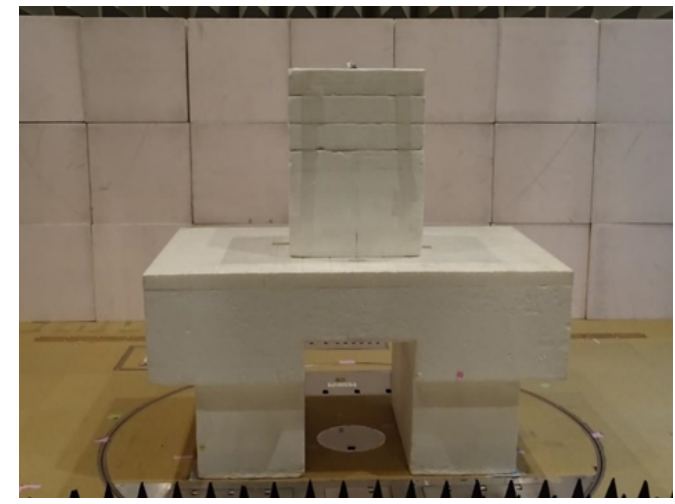
[\ Direction\ to\ the\ Antenna\ ]