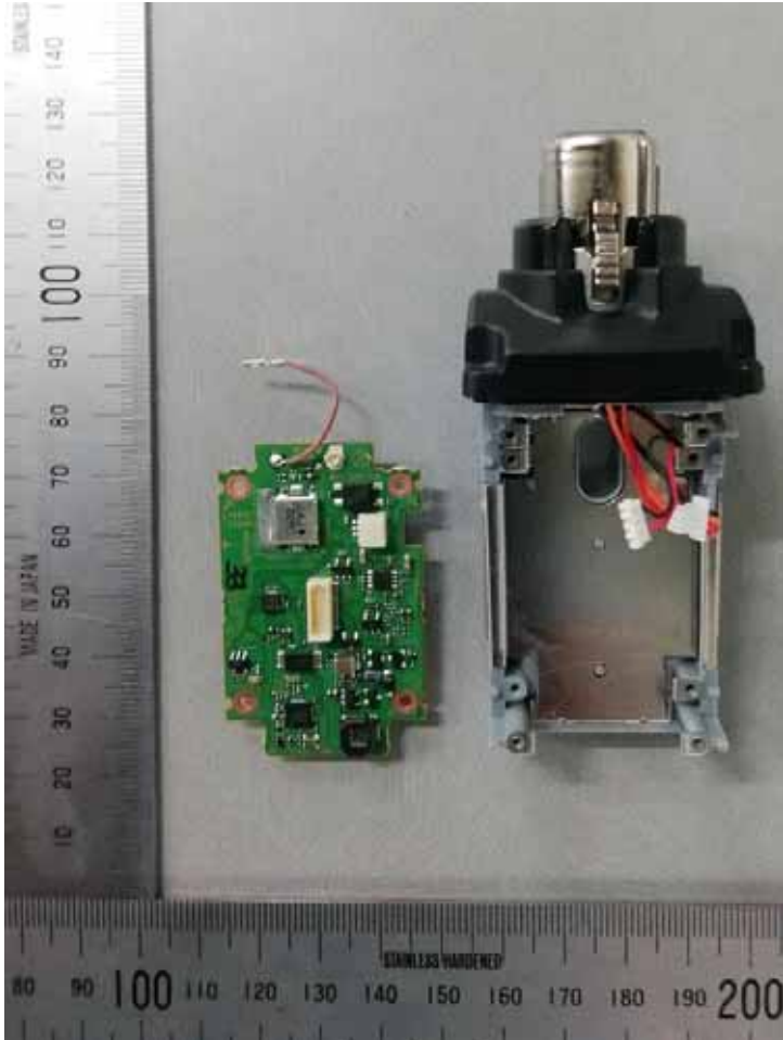
Detached PWB RF-178.