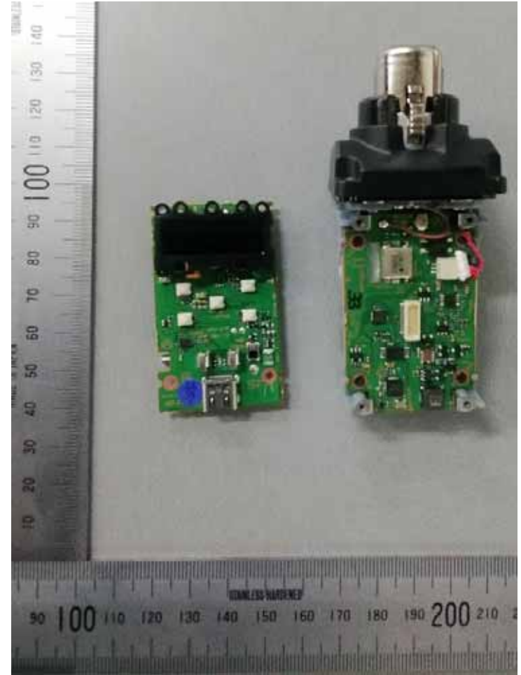
Detached the PWB CPU-472.