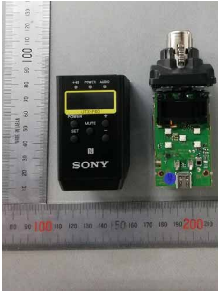
Detached the Case.