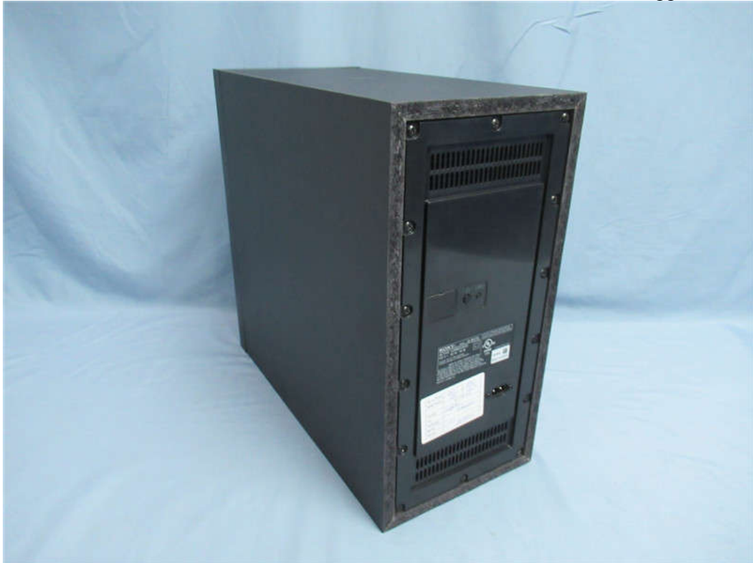
Figure 5 General Appearance of the EUT