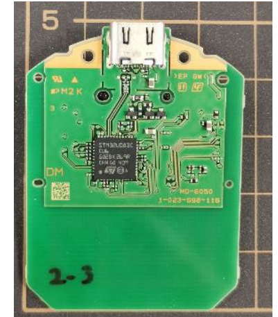
With the resin parts removed (PCB only)