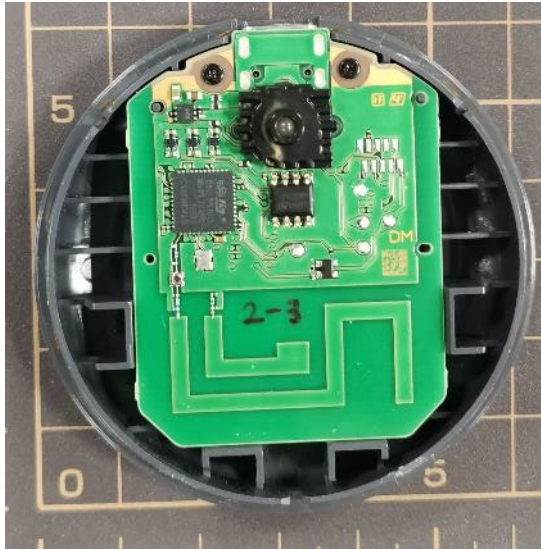
With CASE TOP removed