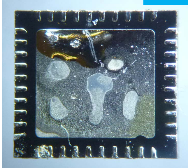
BT IC(Phy) (MT6625L)