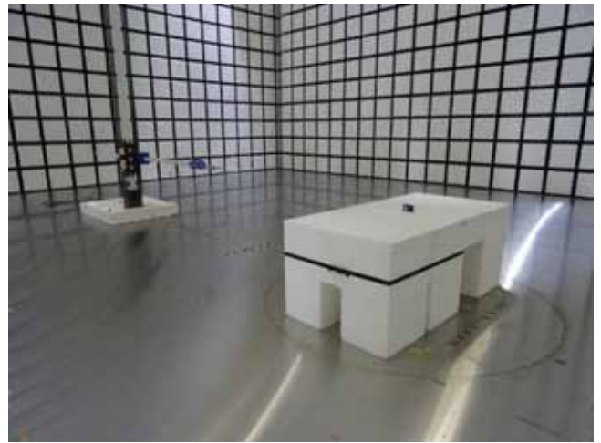
< EUT Axis >