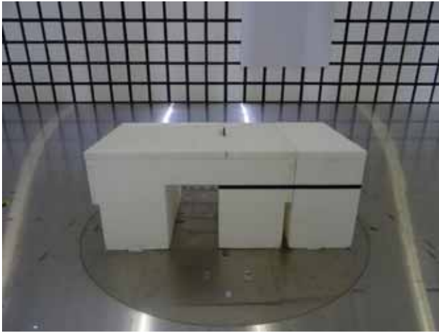
9 kHz - 30 MHz