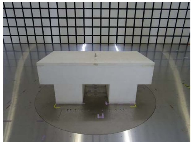
Below 1 GHz