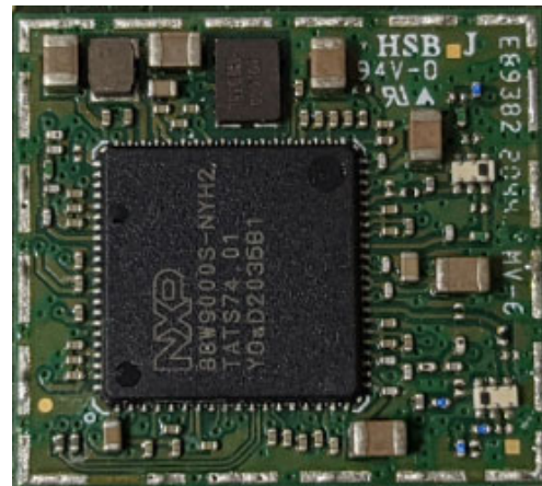
Top (w/o shielding cover)