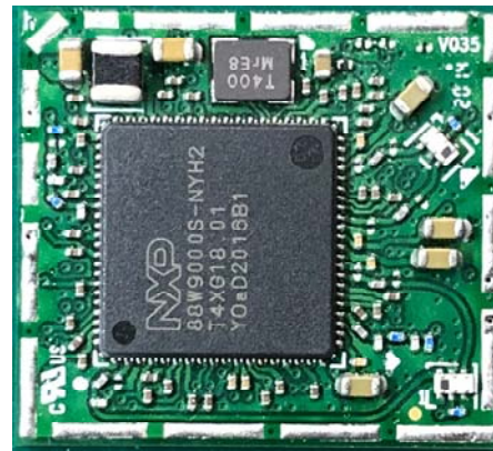
Top (w/o shielding cover)