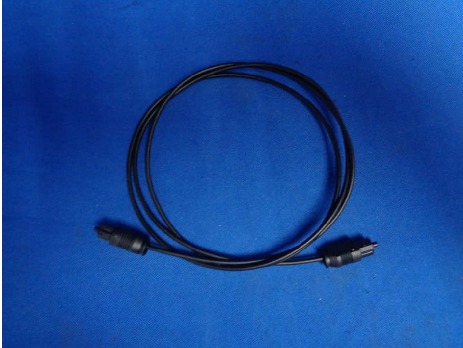
Optical In Cable