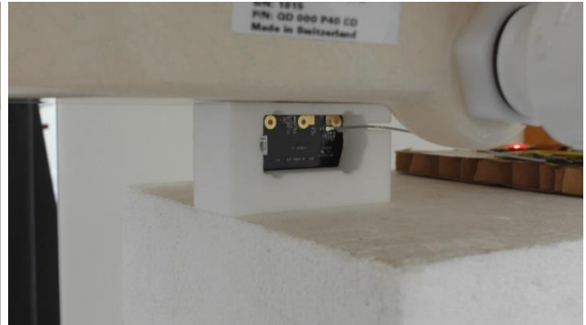
Bottom Side, Test Separation 5 mm