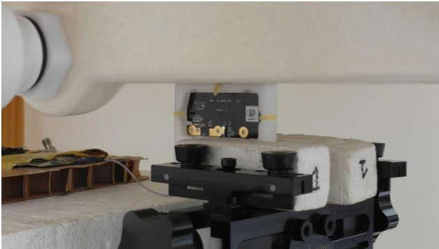
Top Side, Test Separation 5 mm