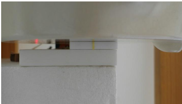
Front, Test Separation 5 mm