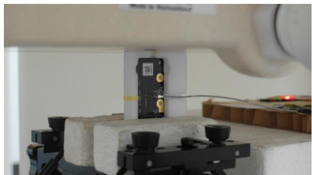
Right Side, Test Separation 5 mm