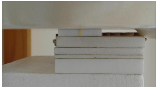
Back, Test Separation 5 mm