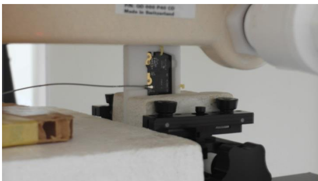
Left Side, Test Separation 5 mm