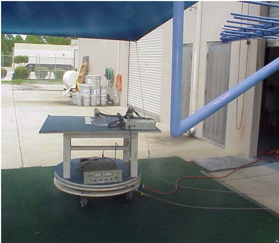
Test fixture at Rubicom (Testing Contractor) showing setup for radiated emissions testing.