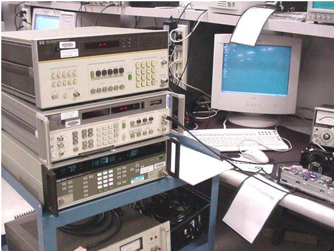
VHF Test Equipment, left side.