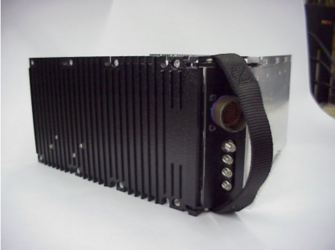
Rear-connector view, with unit open.