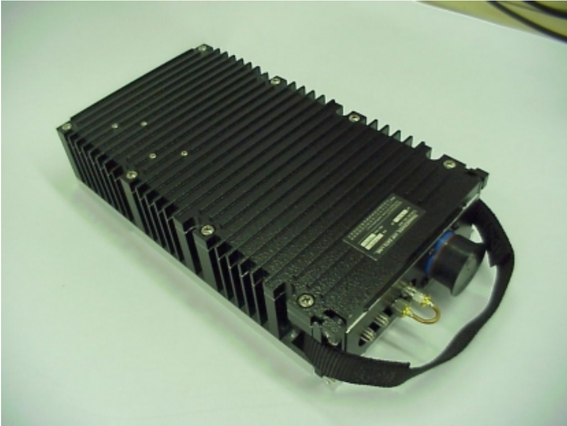
Top exterior view of VDL-2000