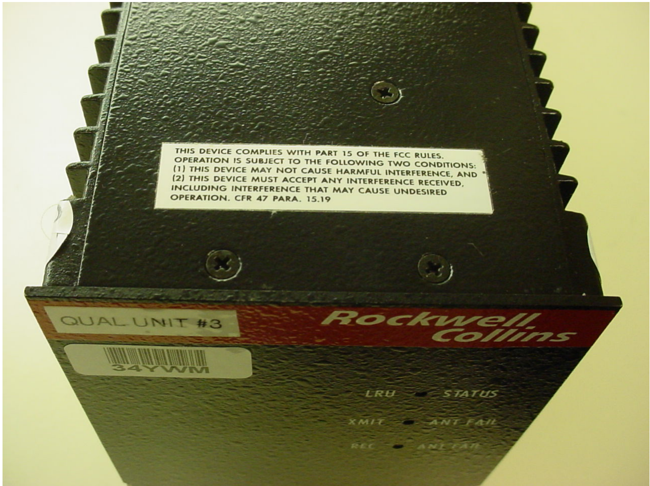
Figure 3: Part 15 Label and Location