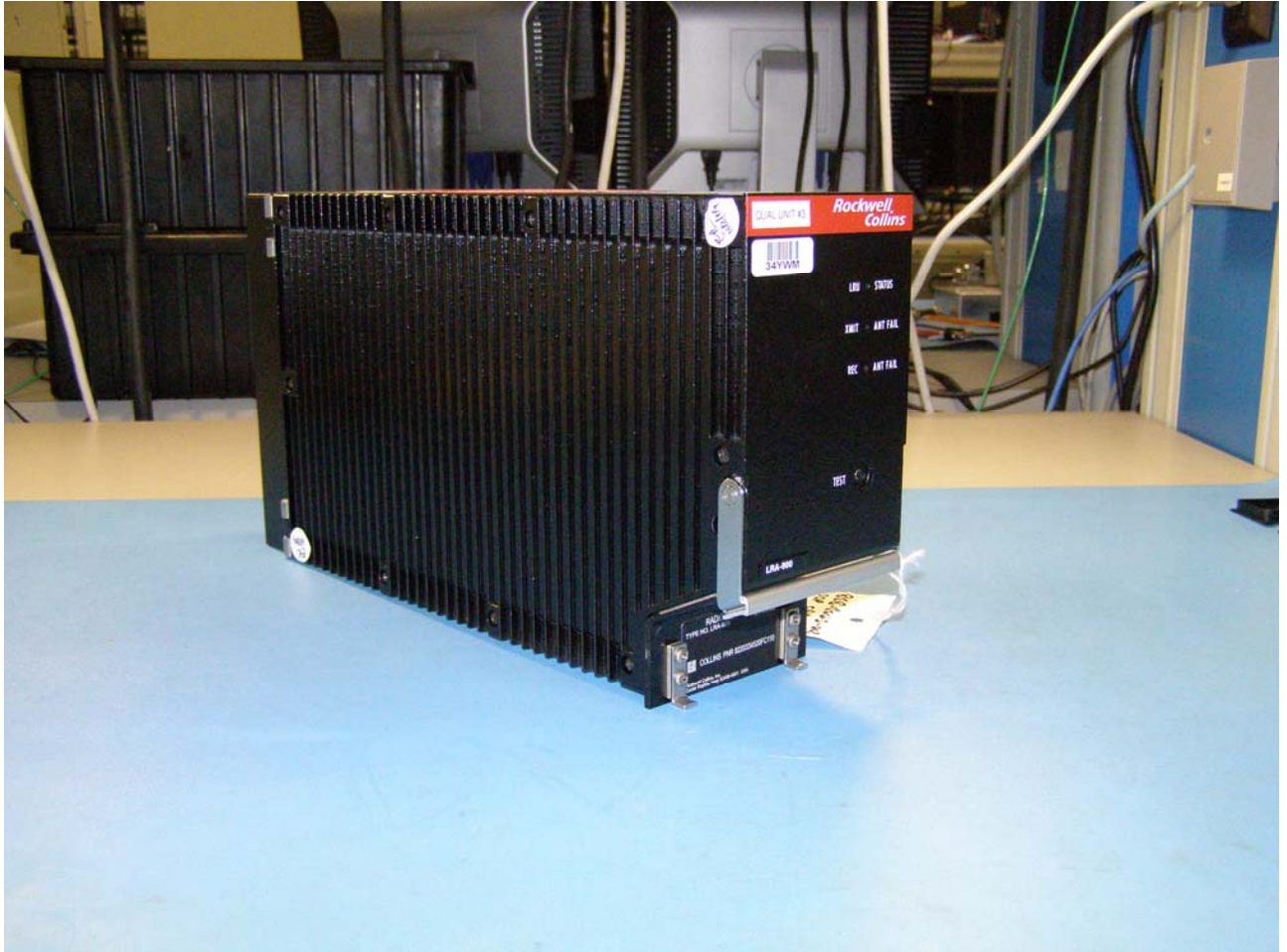
Figure 4: Side View 2