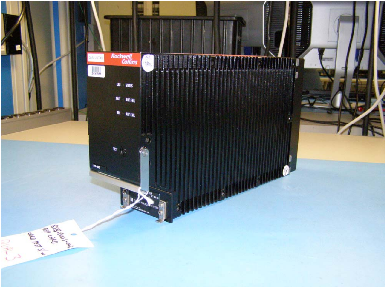
Figure 3: Side View