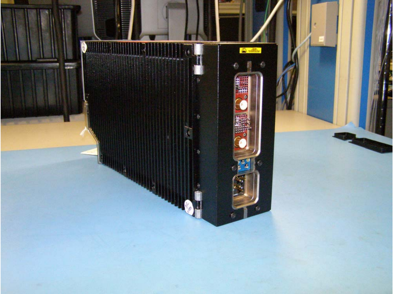
Figure 2: Back View