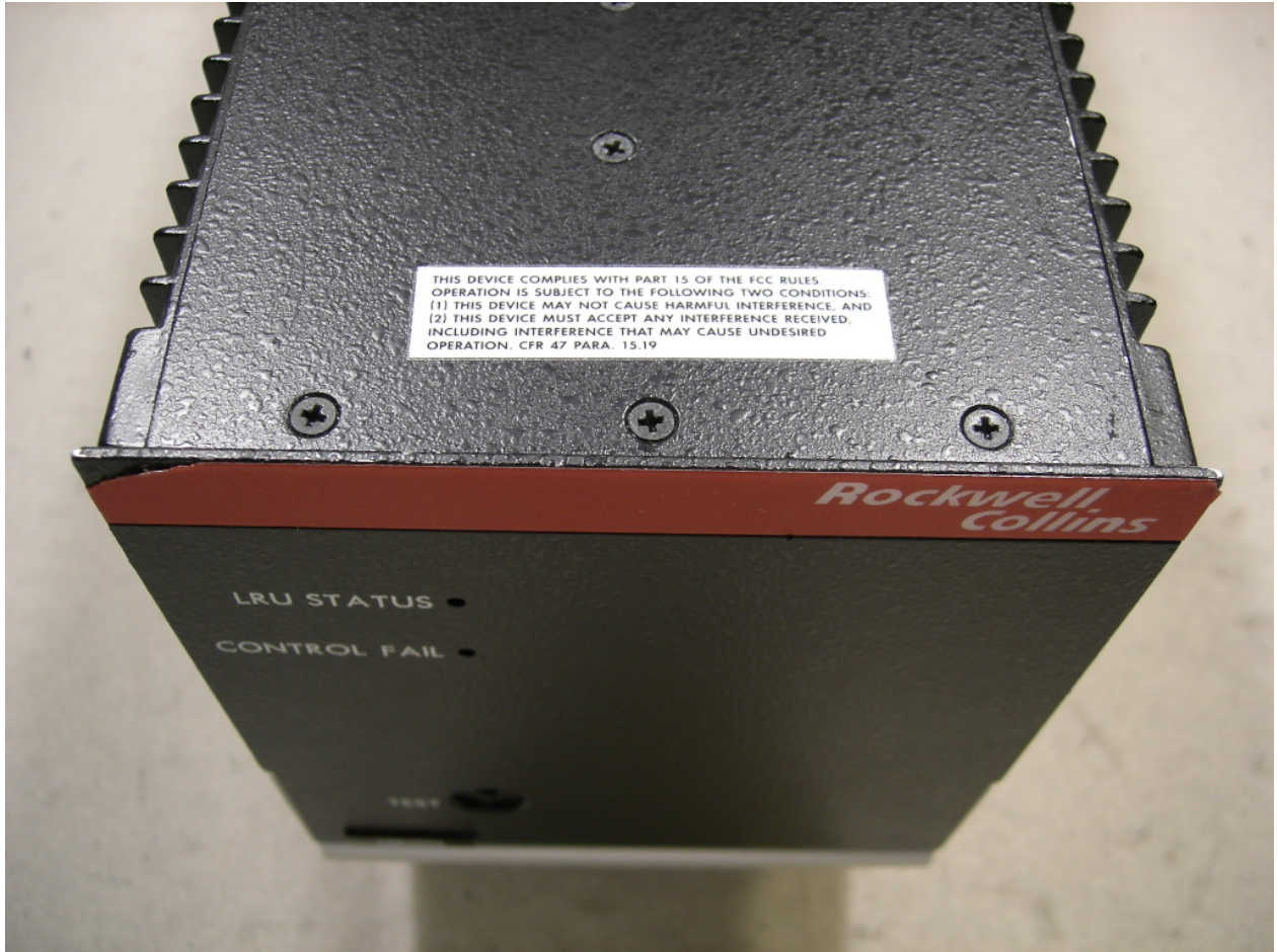
Figure 3 – FCC 2-Part Warning Statement