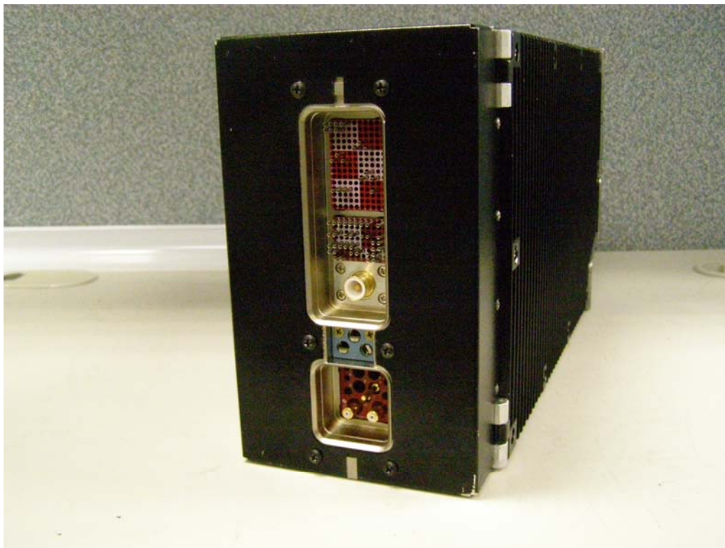
Figure 2 - DME-2100 Rear View