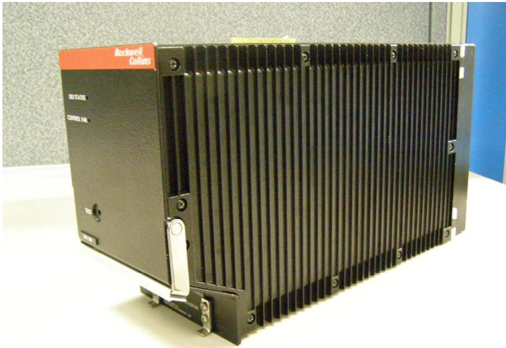
Figure 3 - DME-2100 Side View