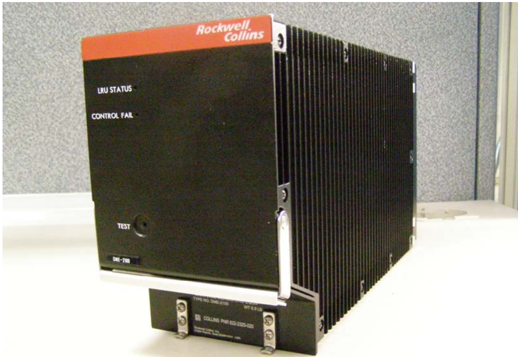
Figure 1 - DME-2100 Front View