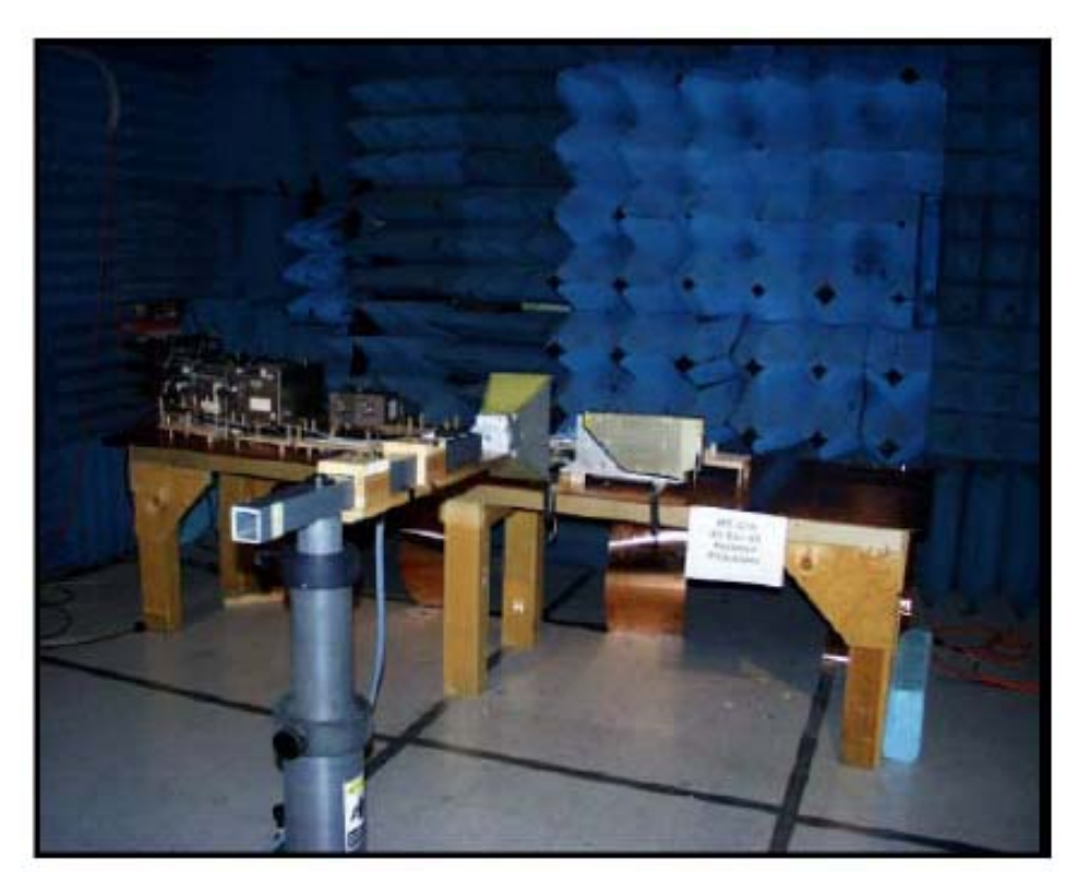
Figure 3 - Radiated Emissions Test Setup - MPB