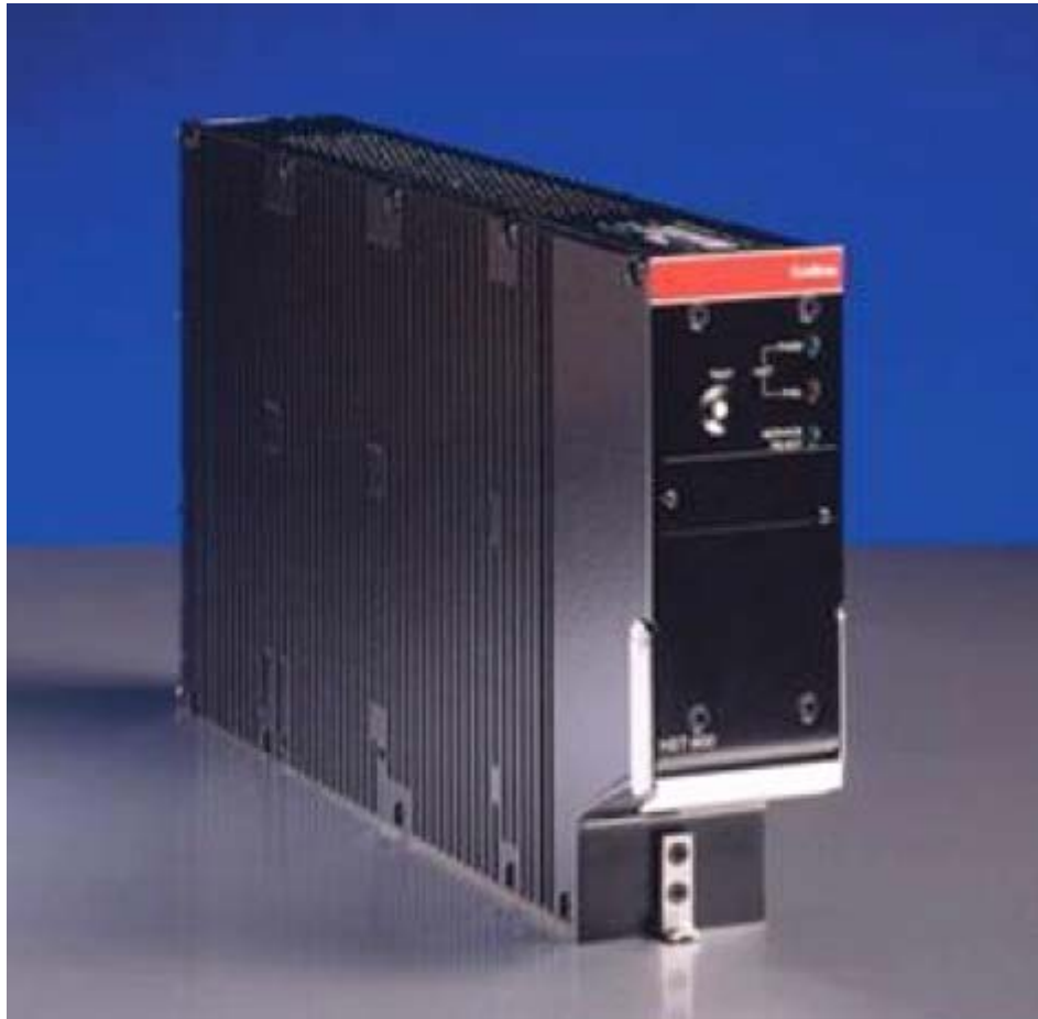
Figure 3 – HST-21X0 Assembly