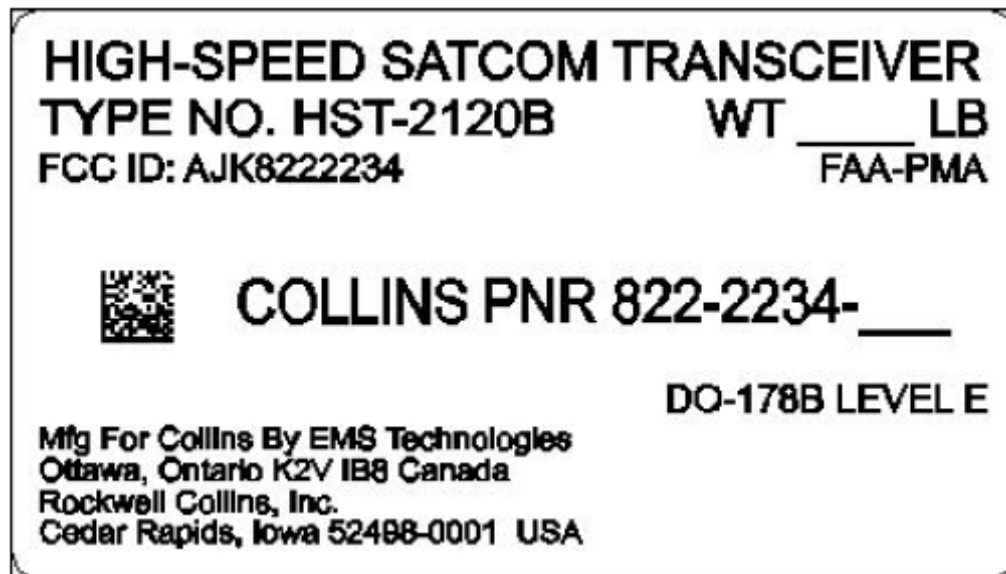
Figure 1 – Nameplate

The following details the front panel nameplate proposed for the HST-2120B. A diagram depicting the nameplate location on the unit is also included.