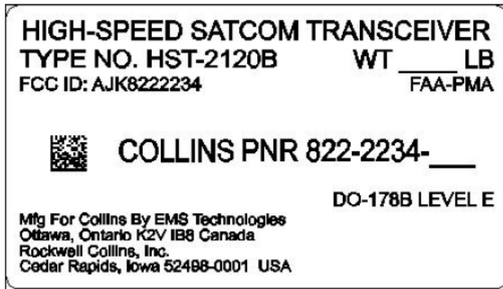
Figure 1 – Nameplate

The following details the front panel nameplate proposed for the HST-2120B. A diagram depicting the nameplate location on the unit is also included.