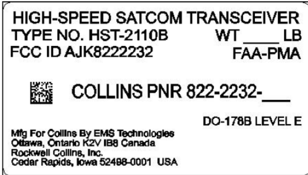
Figure 1 – Proposed Front Panel Nameplate

The following details the front panel nameplate proposed for the HST-2110B. A diagram depicting the nameplate location on the unit is also included.