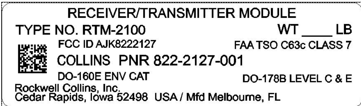
Figure A-1. RTM-2100 ID Label for TSO C63c Compliance

Figure A-3 and Figure A-4 show the location of this label on the fully assembled WRAU-2120 and RTM-2100 unit, respectively.