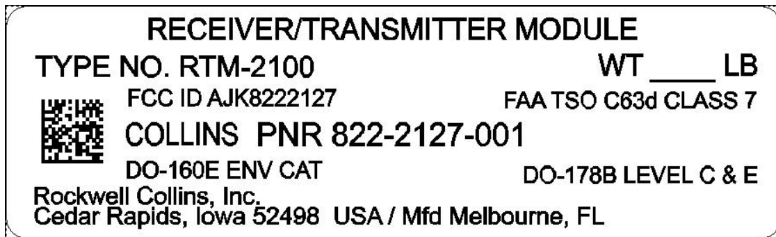
Figure A-2. RTM-2100 ID Label for TSO C63d Compliance