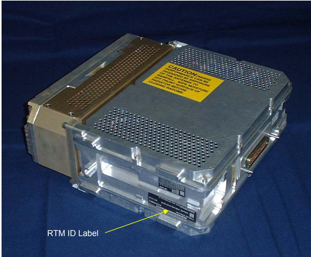
Figure A-4. RTM-2100 with ID Label