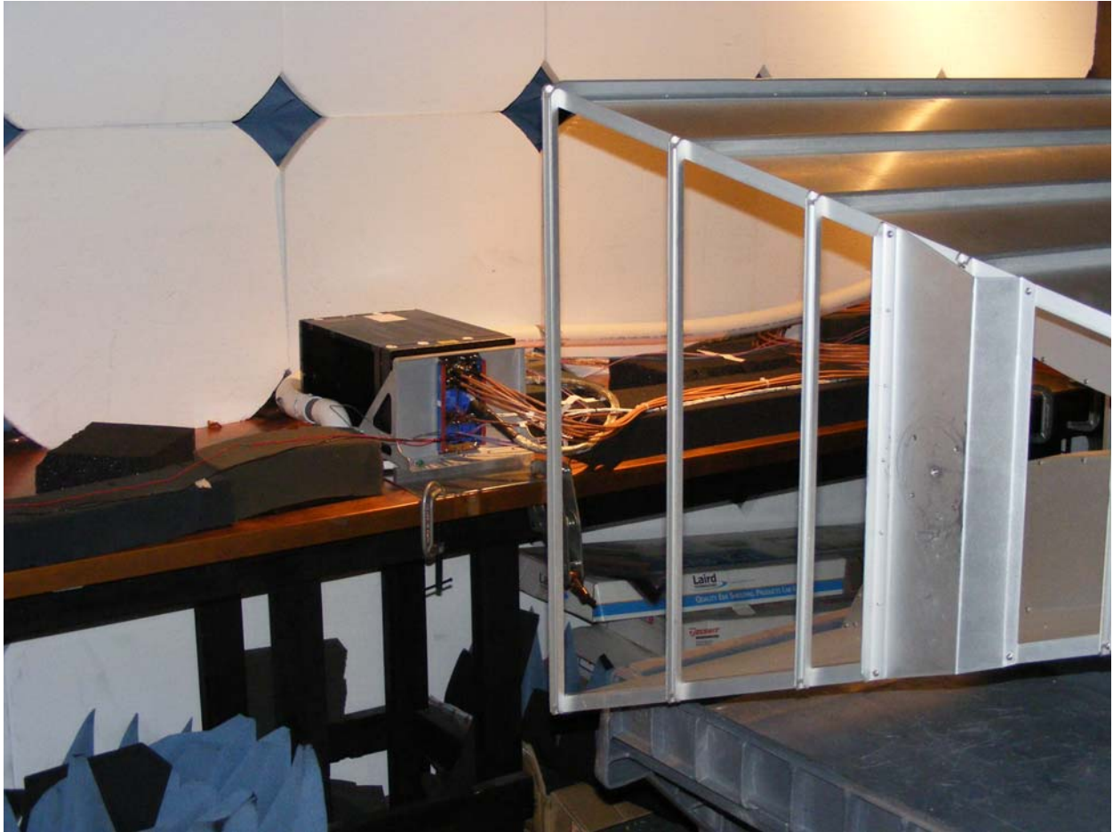
Figure 6 – Radiated Emissions Test. Low Frequency Horn Antenna in Vertical Polarization