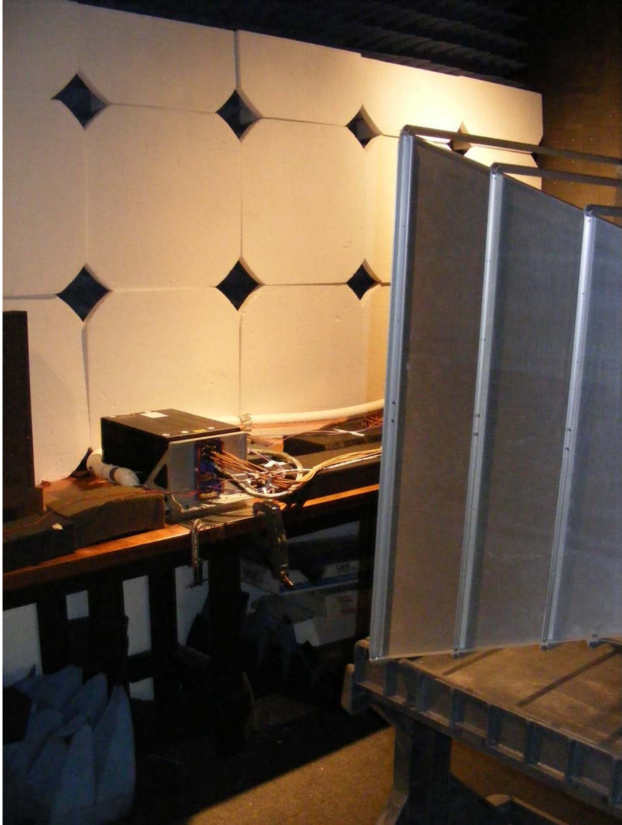
Figure 7 – Radiated Emissions Test. Low Frequency Horn Antenna in Horizontal Polarization