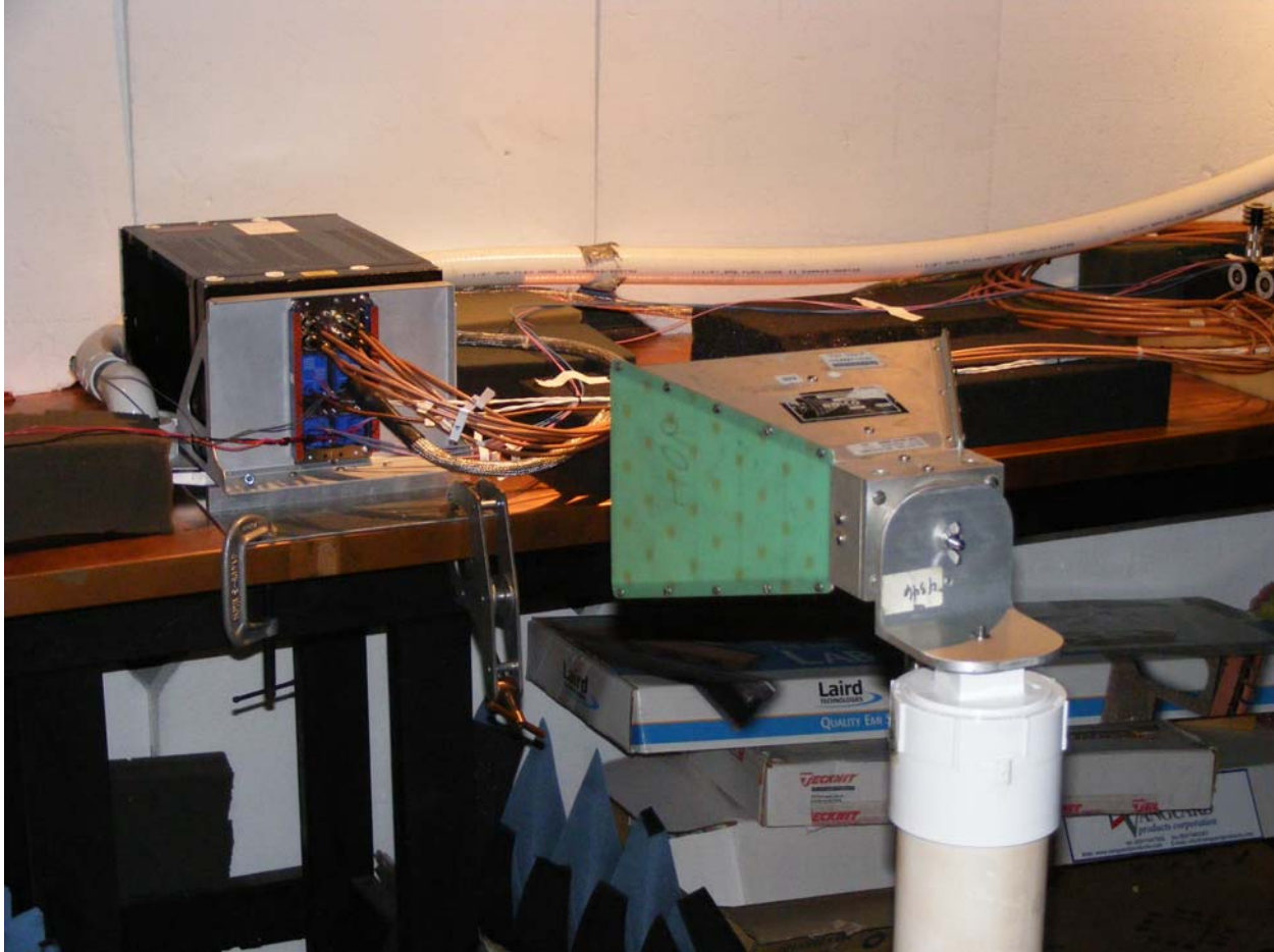
Figure 4 – Radiated Emissions Test. Standard Horn Antenna in Vertical Polarization