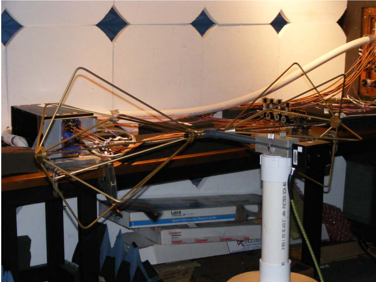
Figure 2 – Radiated Emissions Test. Biconical Antenna in Horizontal Polarization