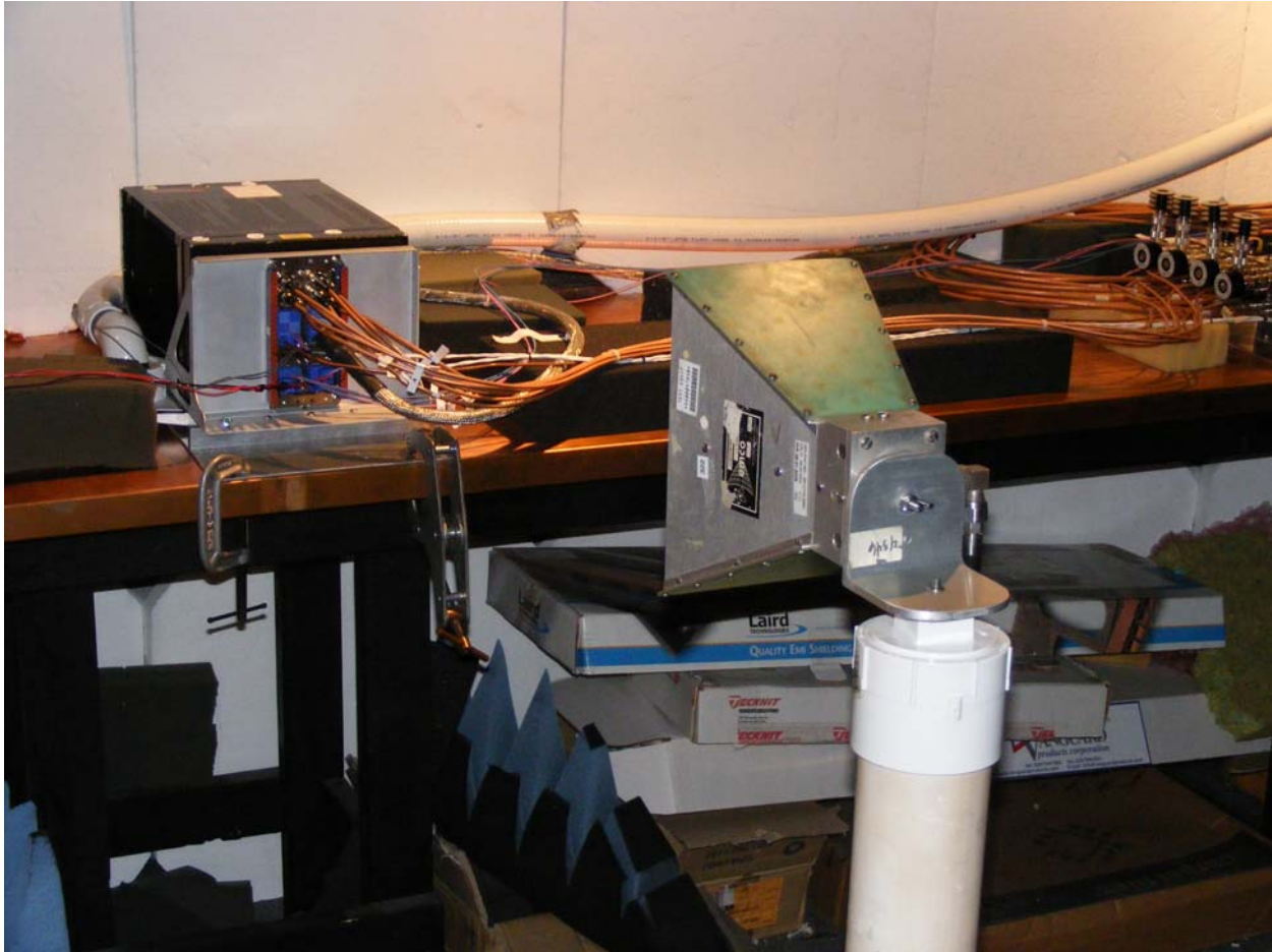
Figure 5 – Radiated Emissions Test. Standard Horn Antenna in Horizontal Polarization