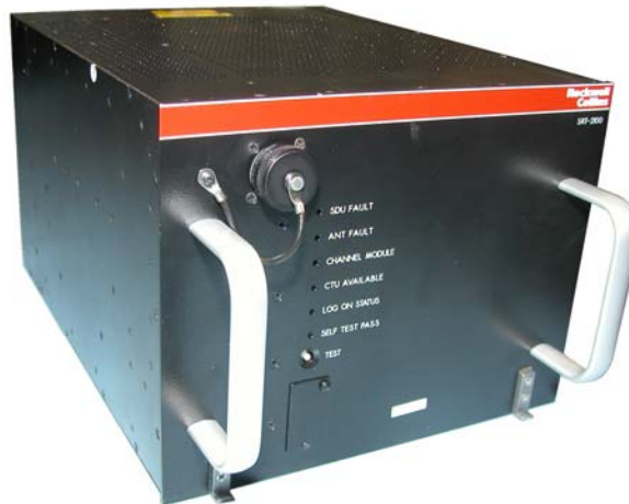
Figure 1 SRT-2100B Satellite Receiver/Transmitter

The SDU function of the SRT-2100B is the interface to all other aircraft systems. It contains all data processing functions, modems and channel tuning synthesizers including a voice CODEC (coder-decoder) and synthesizer pair for each voice channel.