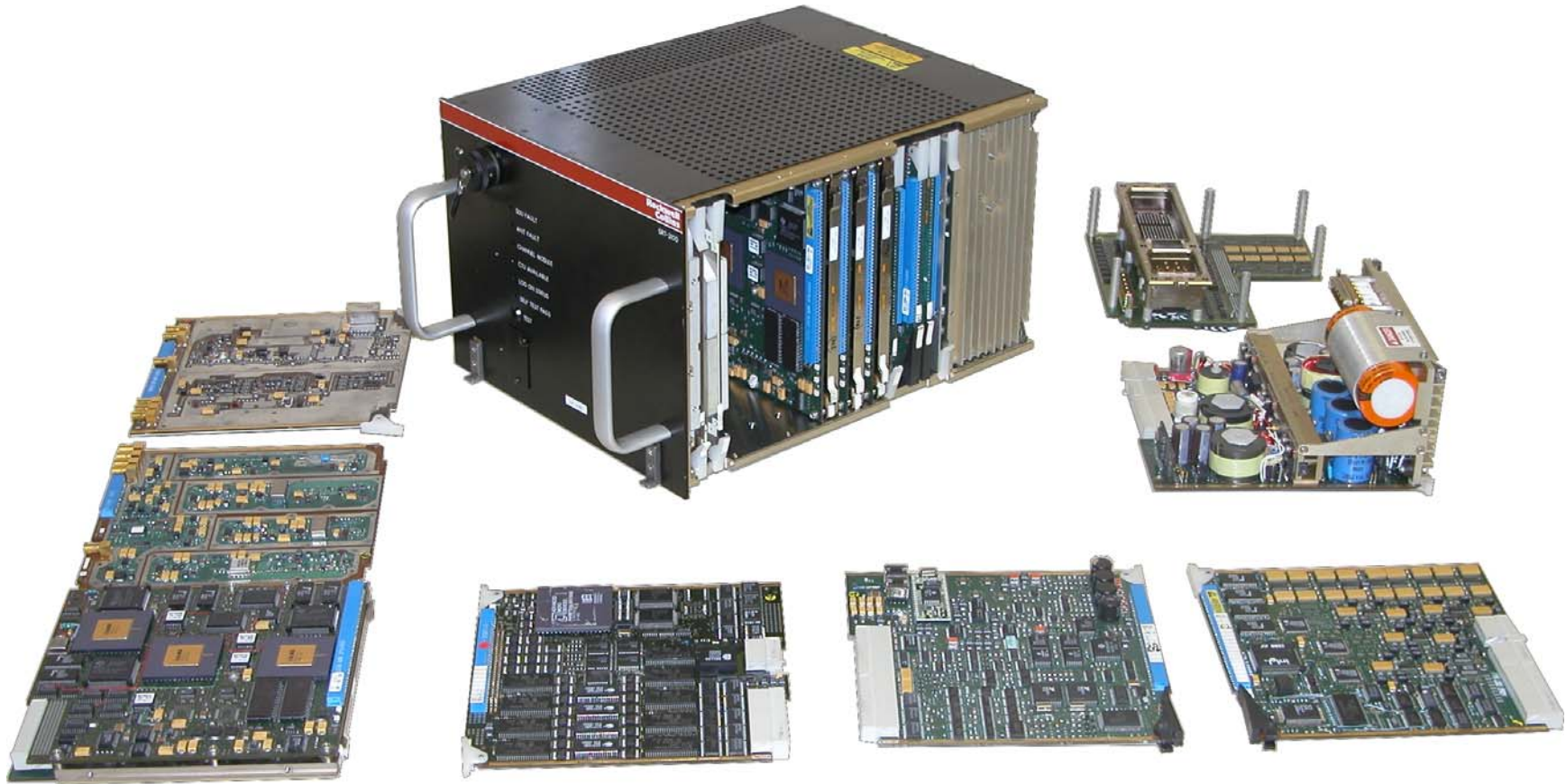
Figure 5 SRT-2100B Complement of Card Assemblies