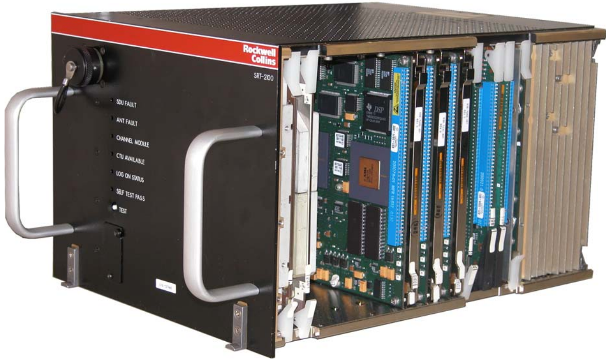
Figure 4 SRT-2100B with Side Cover Removed