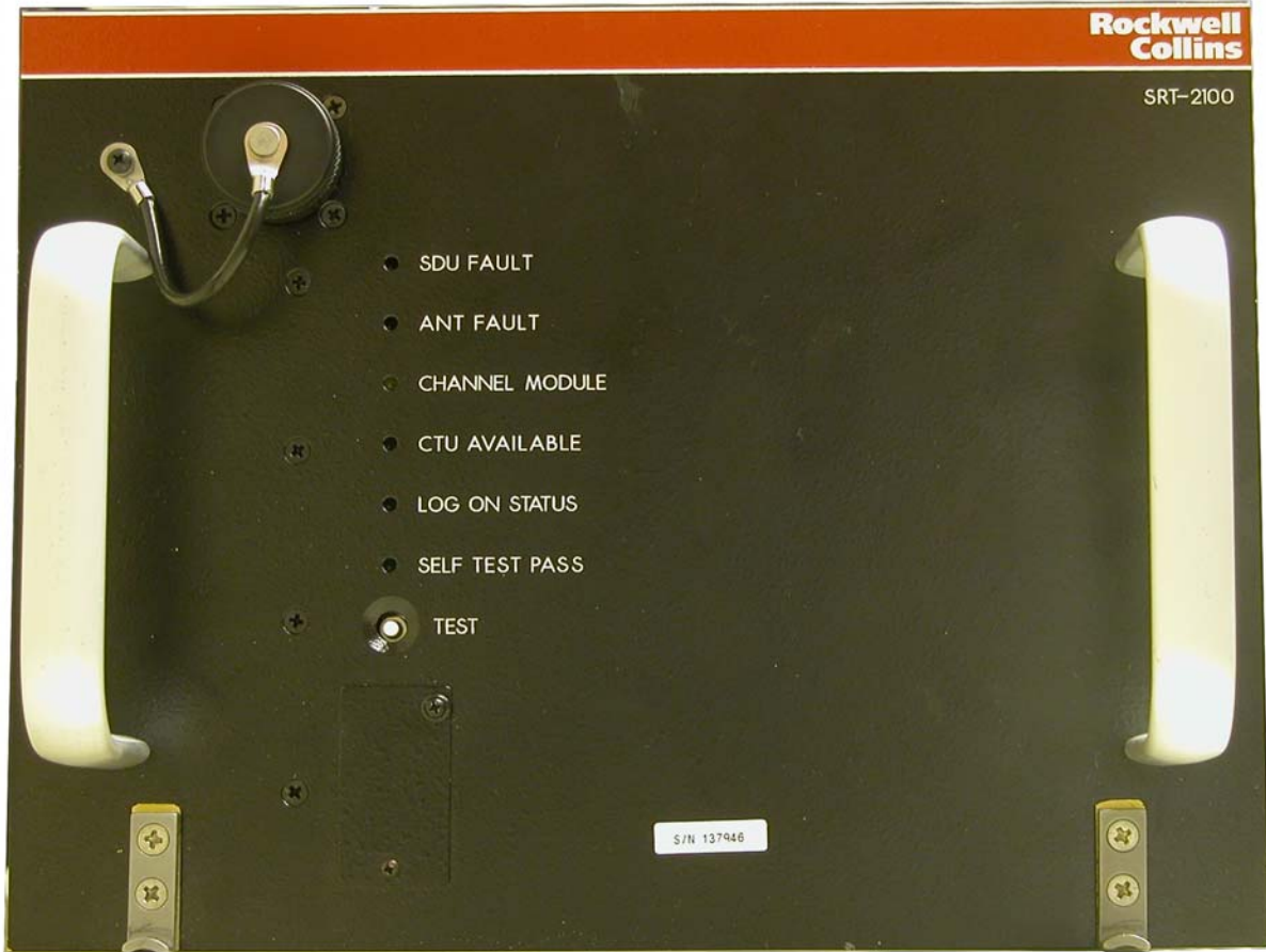
Figure 3 SRT-2100B Front Panel