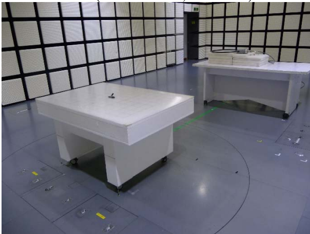
Rear (below 30 MHz, Horizontal)