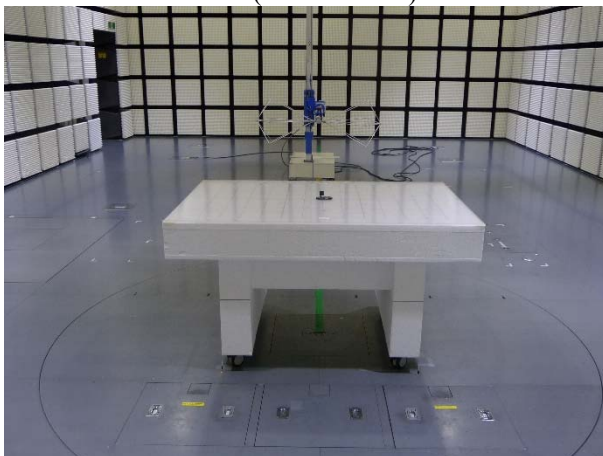
Rear (below 1 MHz)