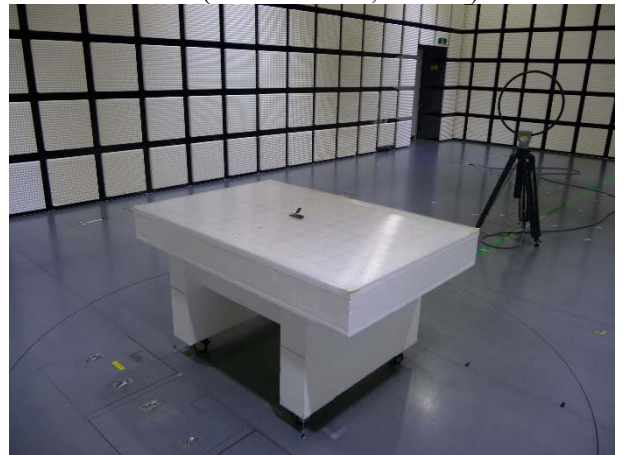
Rear (below 30 MHz, Vertical)