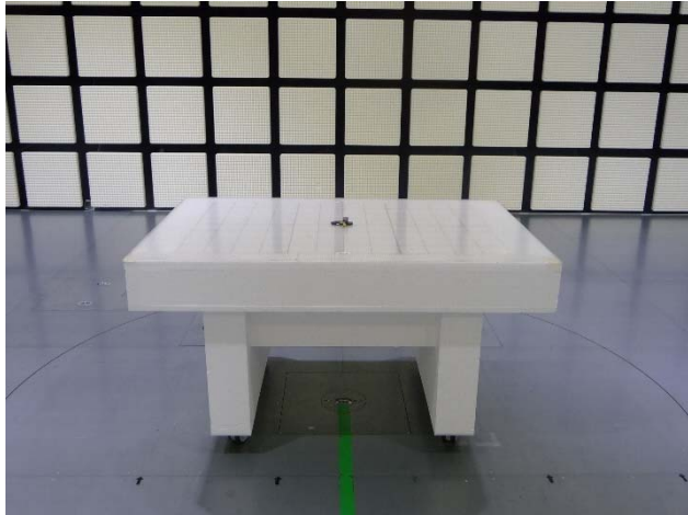
Front (Below 1 GHz)