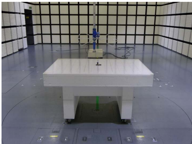
Rear (Below 1 GHz)