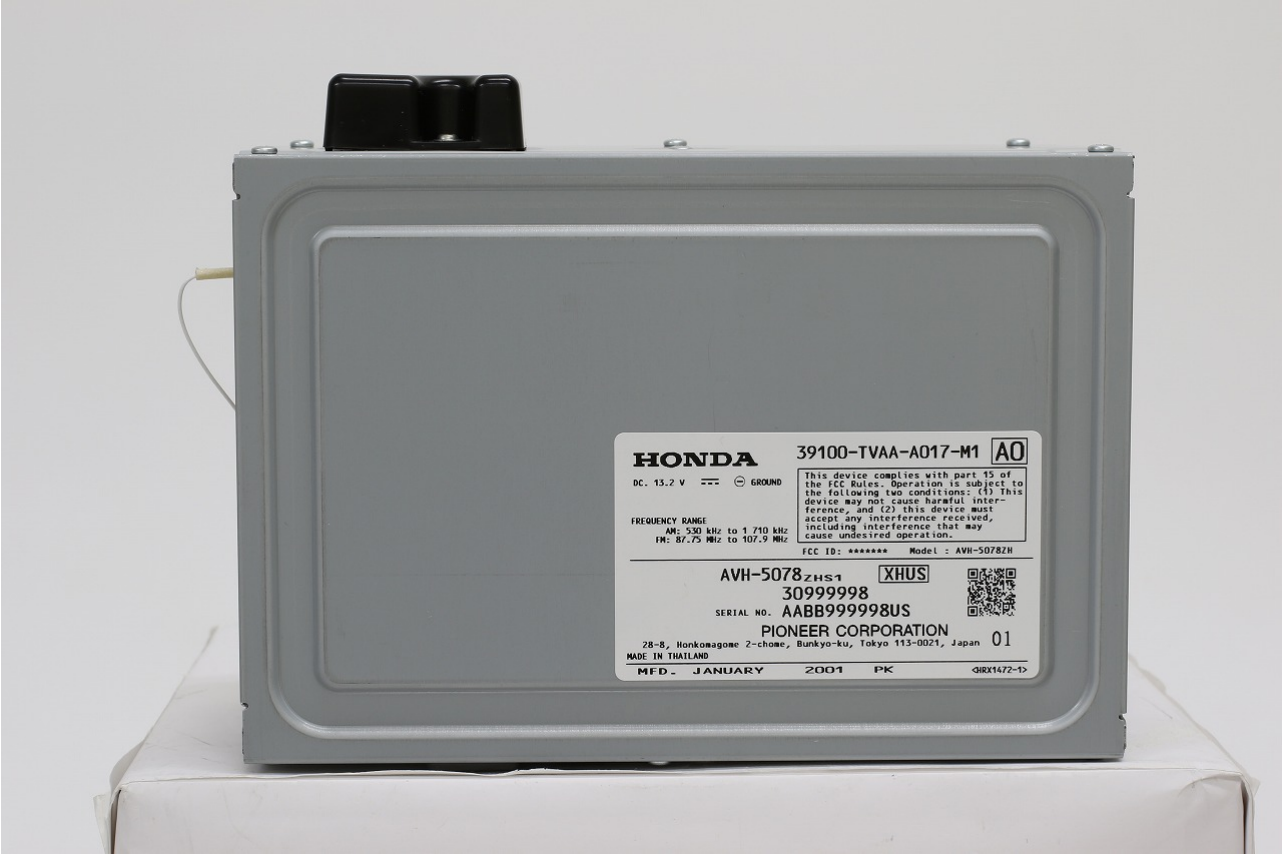
Top of product