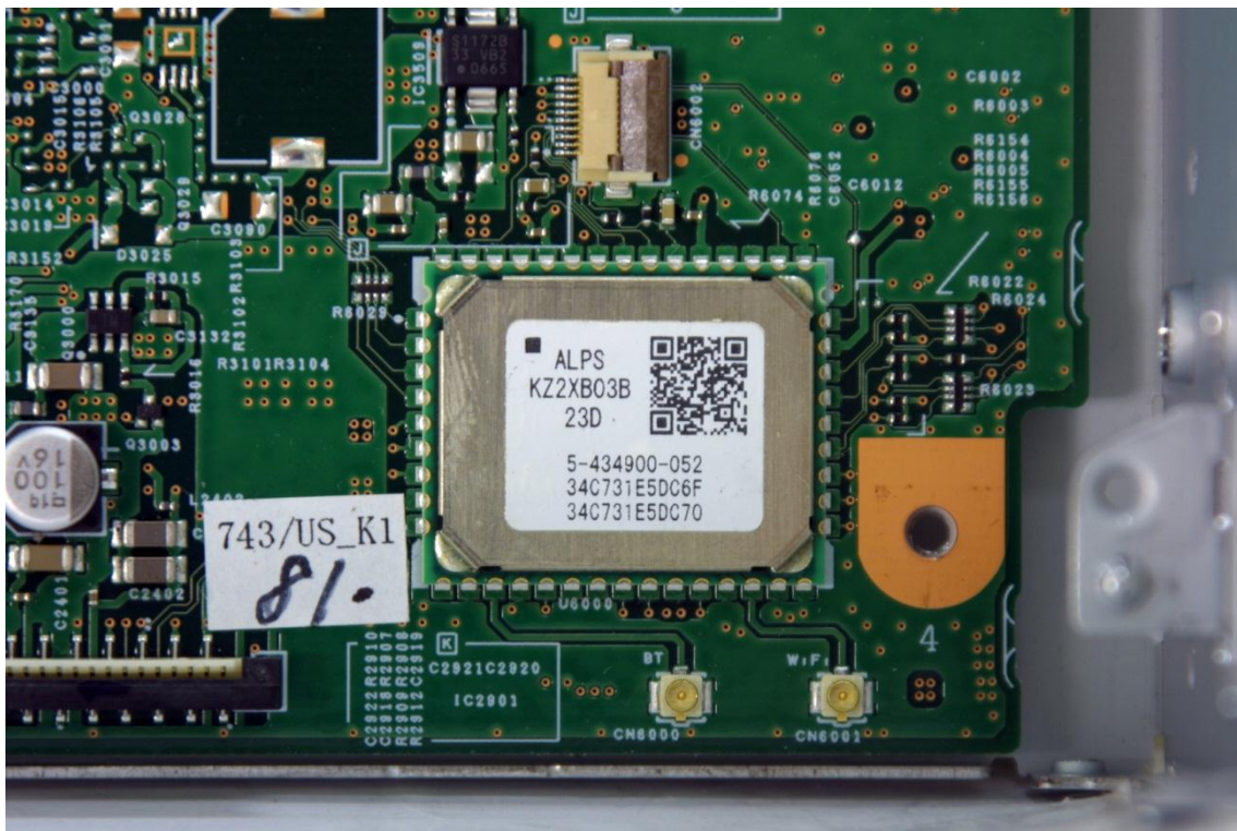
Side A with Shield