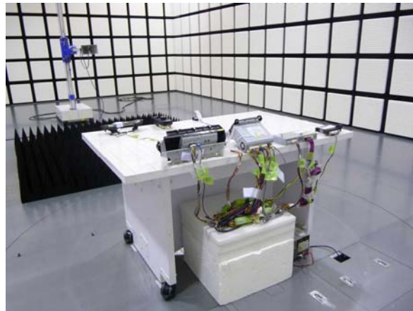
(Rear (above 1GHz))