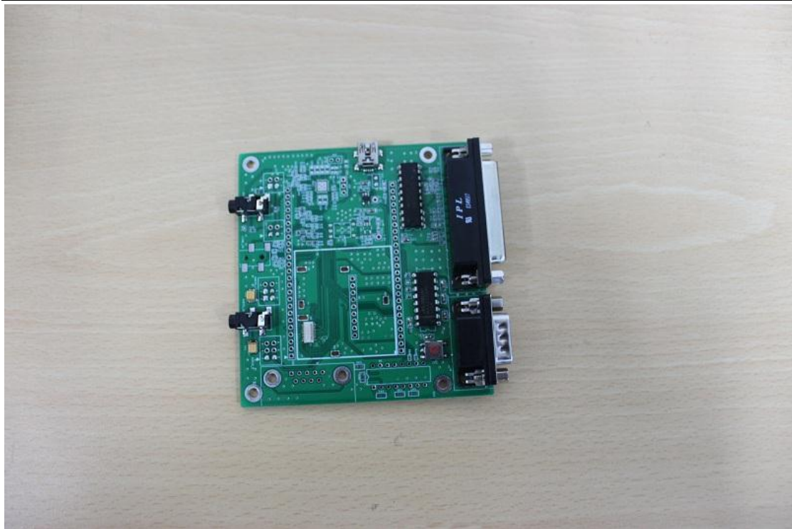
PCB Kit Frontside