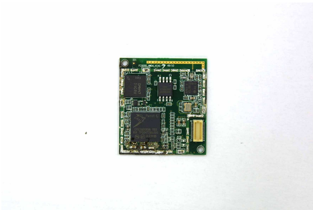
Bluetooth Board side A without shield