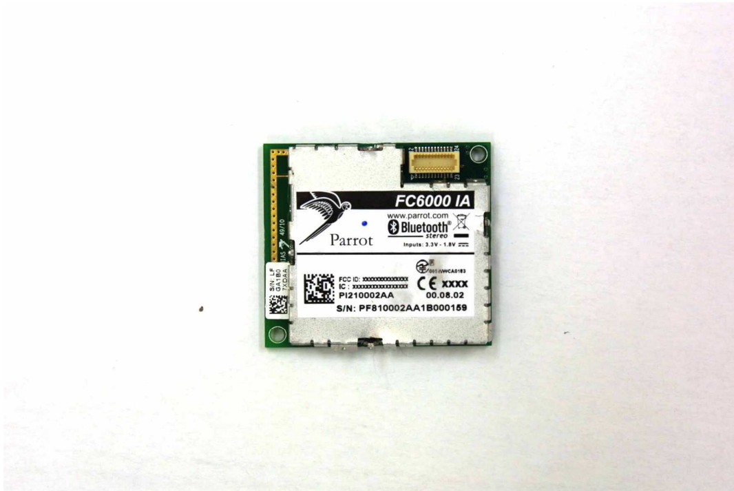
Bluetooth Board side A with shield