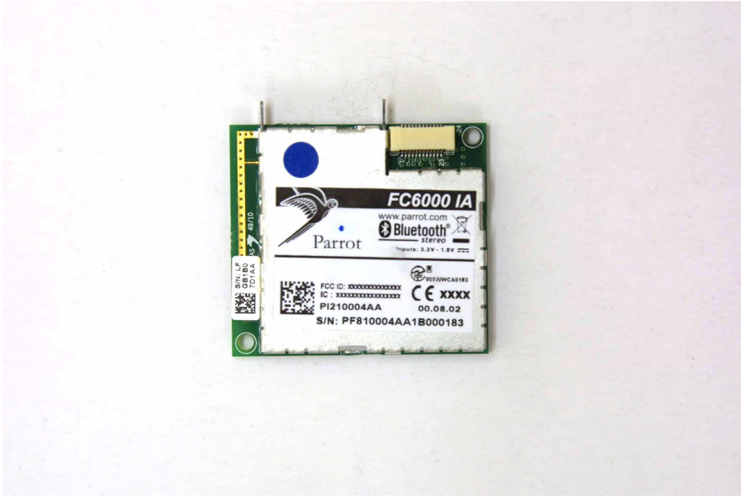
Side A with Shield