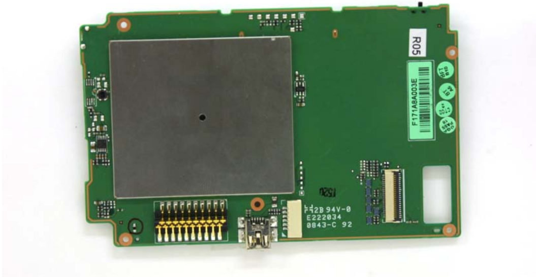
PWB Side B