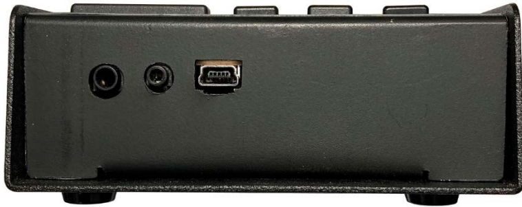
EXHIBIT: RBS-477DMR bottom view showing audio and programming jacks