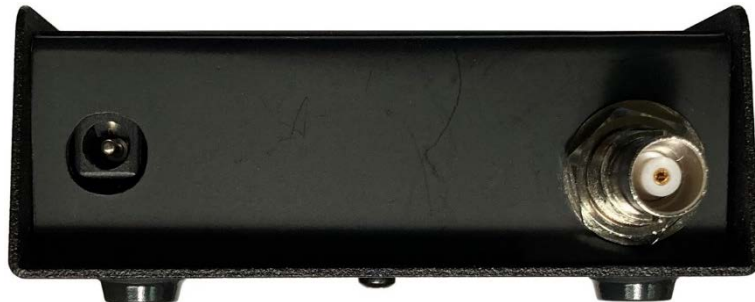
EXHIBIT: RBS-477DMR top view showing controls DC power and antenna connectors