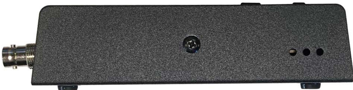
EXHIBIT: RBS-477DMR left side view