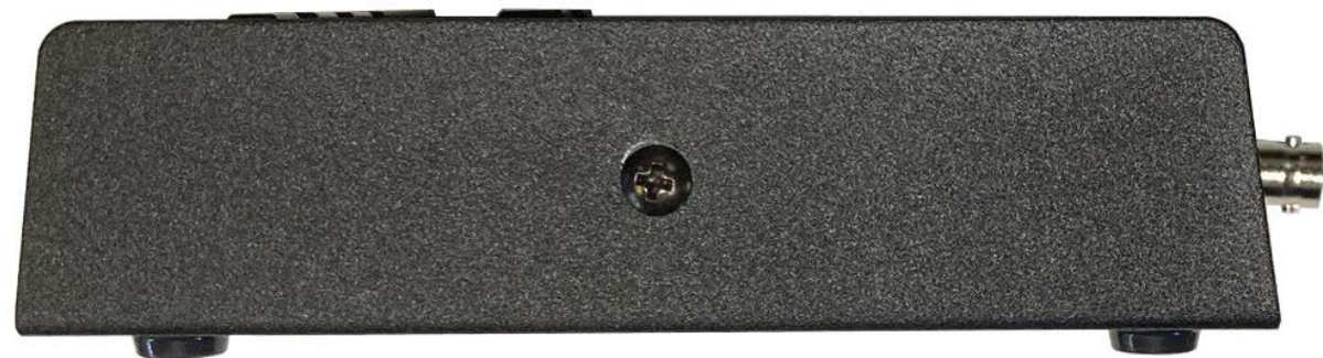
EXHIBIT: RBS-477DMR right side view