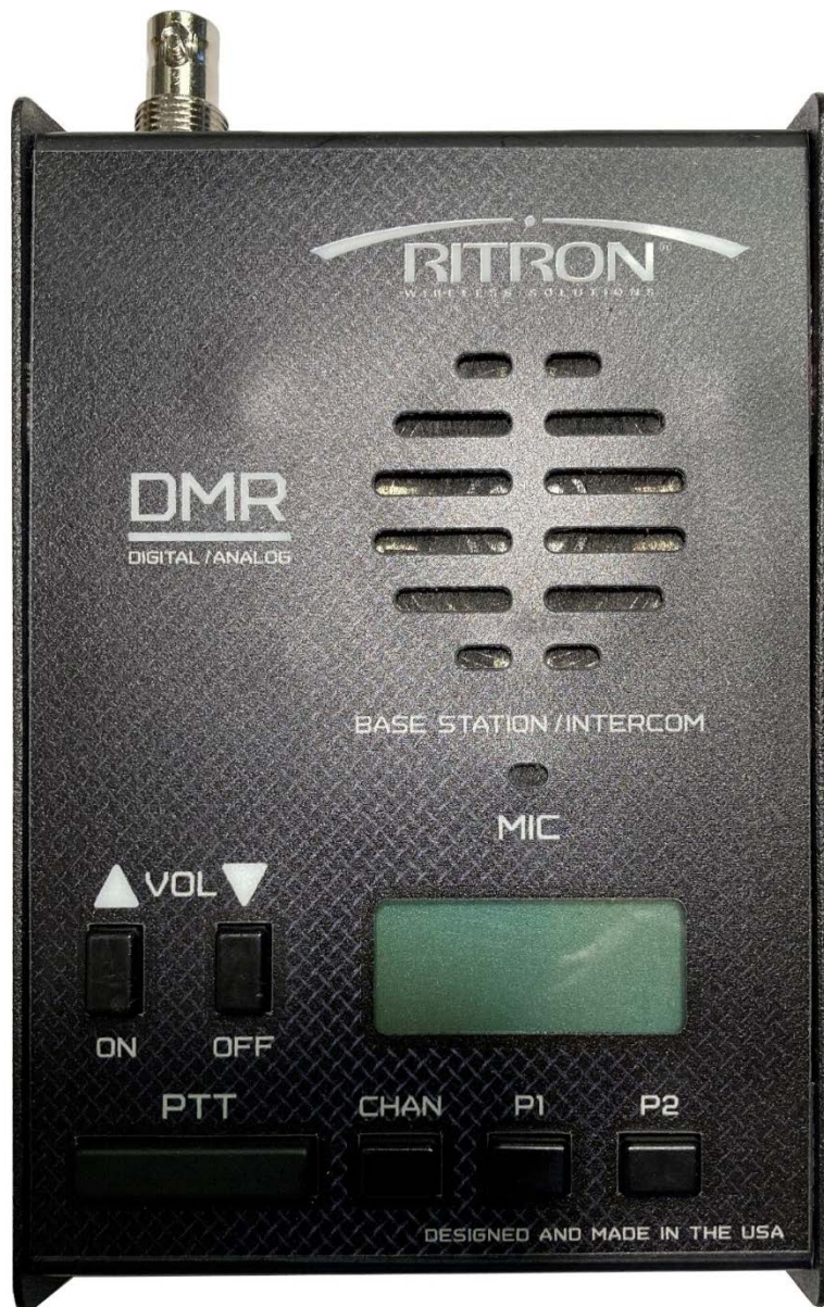
EXHIBIT: RBS-477DMR front view showing controls and display