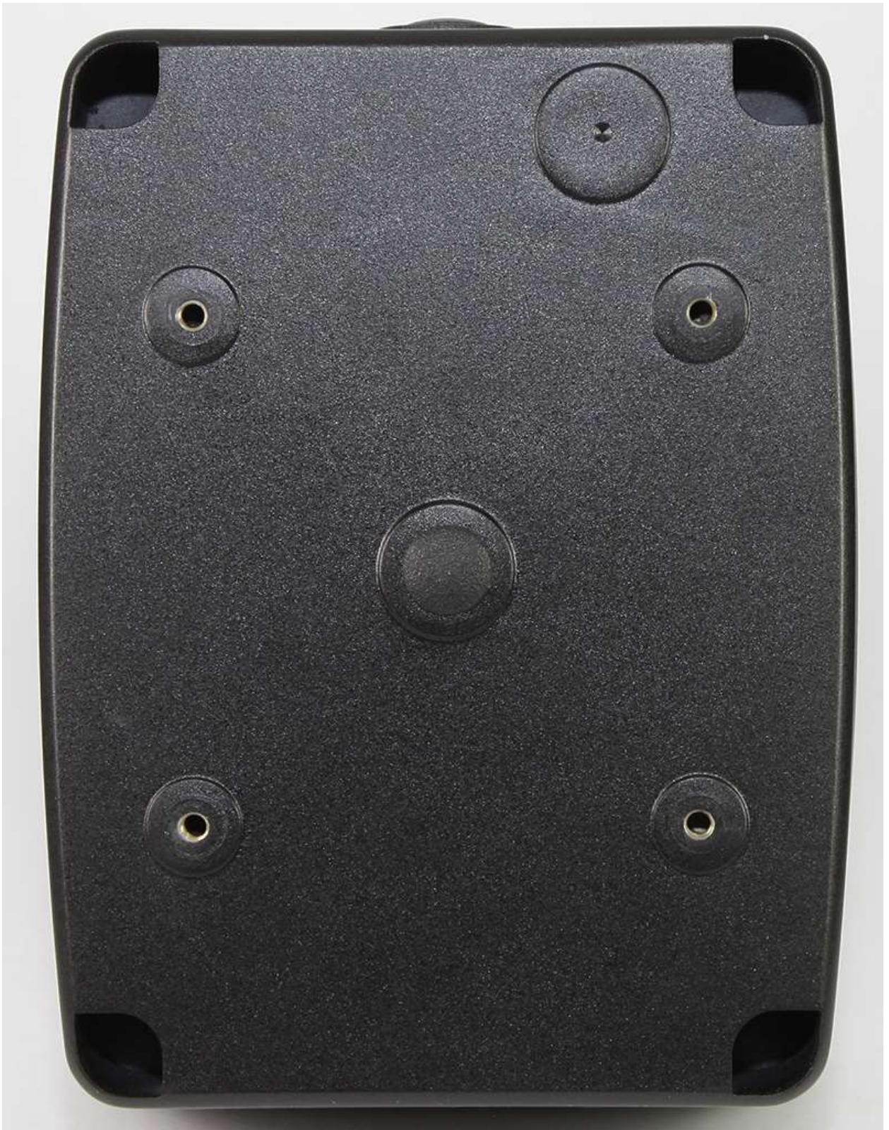
EXHIBIT: RQX-417NX back view