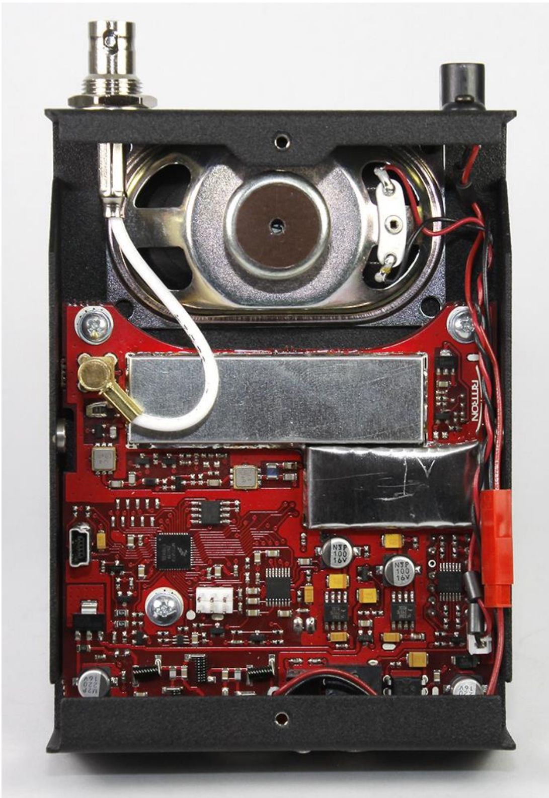
EXHIBIT: JBS-446D with case open to show printed circuit board installation