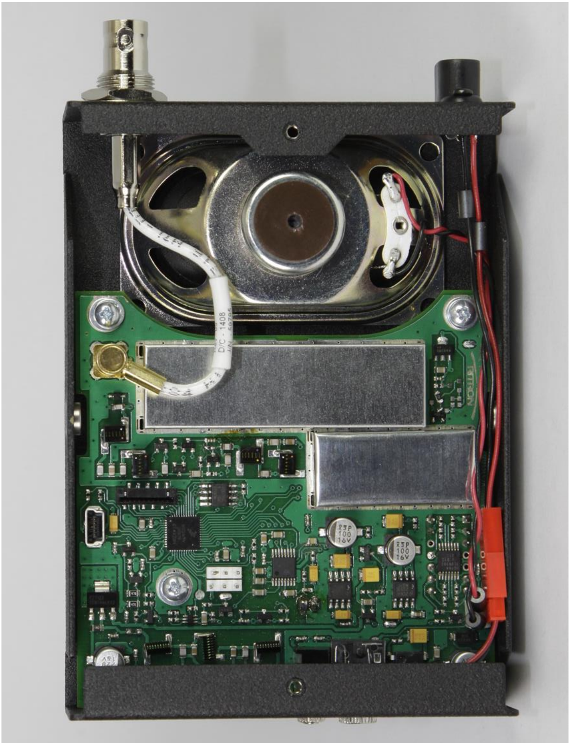
EXHIBIT: JBS-146M with case open to show printed circuit board installation FCC ID: AIERIT37-146M