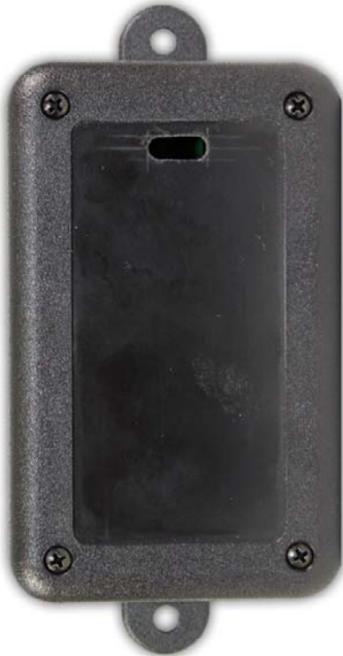
EXHIBIT: RQA-1B and RQA-4B front view without membrane keypad