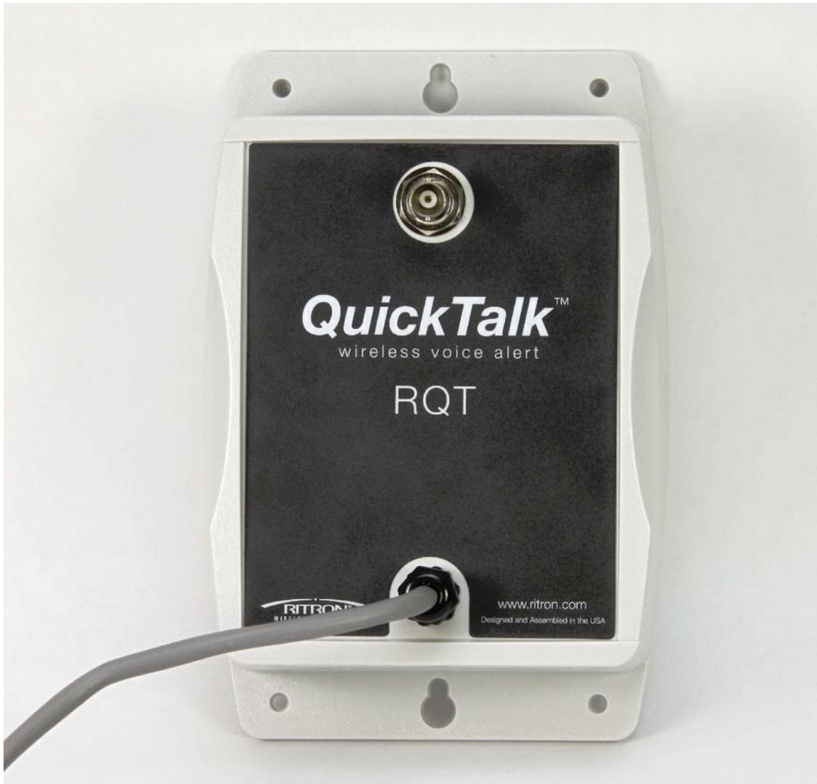
EXHIBIT: RQT-451 front view

FCC ID: AIERIT32-451 with AIERIT32-433-RCVR installed within