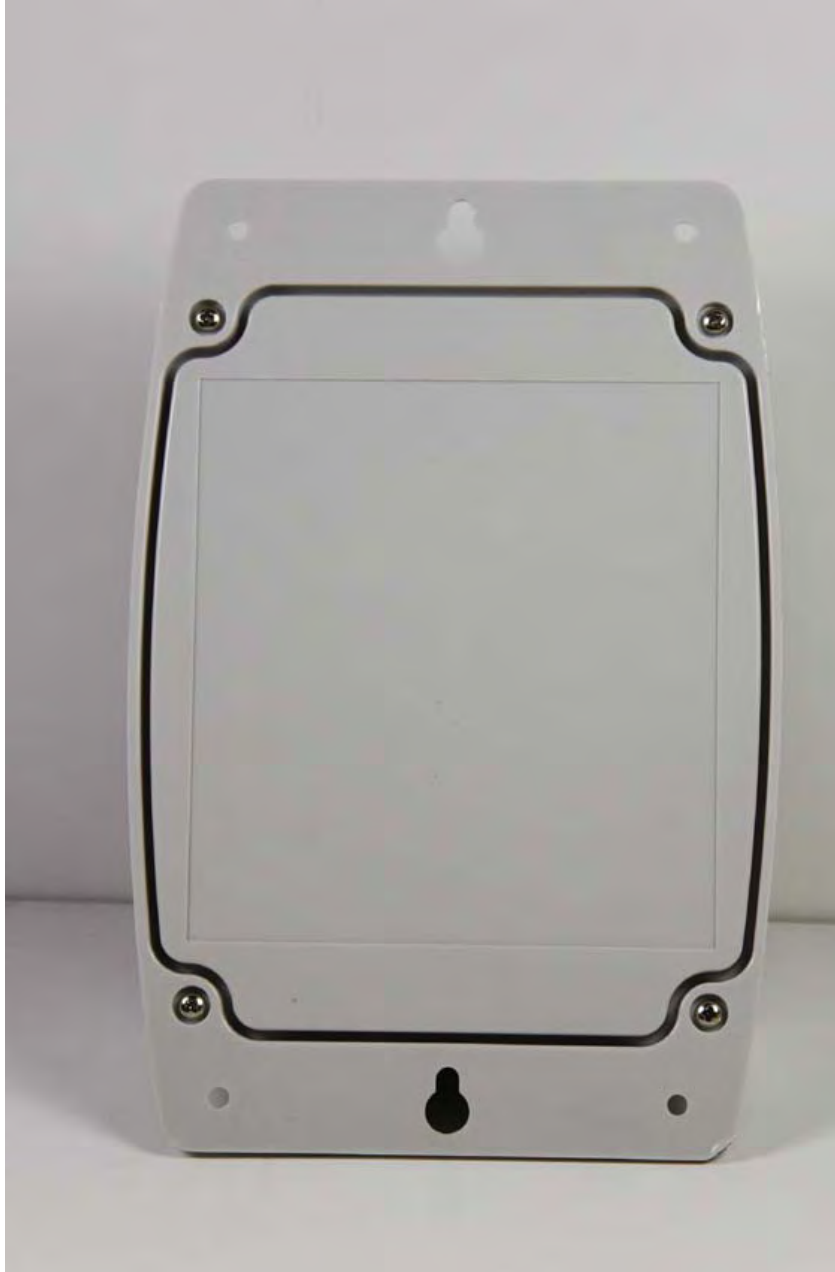
EXHIBIT: RQA-152M and RQT-152M back view